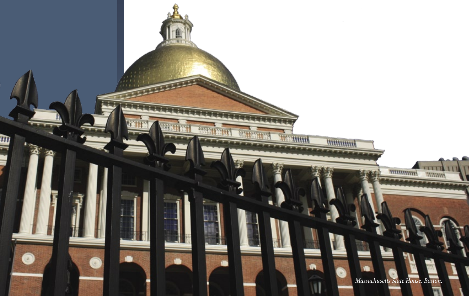
Massachusetts State House, Boston.

Counties in three states – New Hampshire, Massachusetts, and Oregon – launched pilot programs in 2010. Pilot projects are under consideration for 2011 in Colorado, Utah, Wyoming, and Federal District Court in the Southern District of New York. Iowa and Minnesota have expressed interest in launching pilot projects.