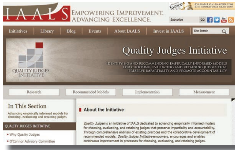
Quality Judges Initiative website, Institute for the Advancement of the American Legal System

Public Narrative. The evaluation team should share their assessment with the full evaluation commission and answer any questions that commission members may have. Commission members should consider the evaluation team's assessments of the judge's opinions alongside the results of the various survey questions pertaining to the judge's opinions and draft the public narrative on those bases. The narrative should summarize all evaluation sources, referencing specific areas in which the judge has excelled and any areas where improvement may be needed. The evaluated judge should be given an opportunity to review the draft public narrative and discuss it with the commission before publication.